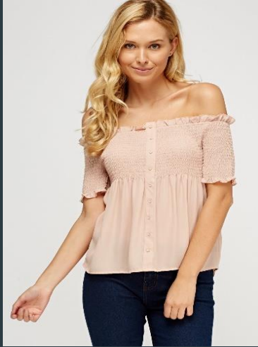
Off Shoulder Top