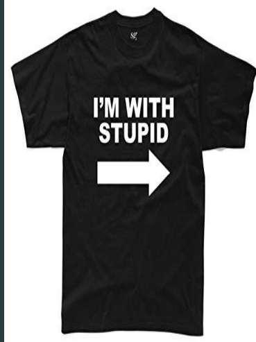
Offensive Statement Shirts