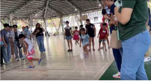
Community children joyfully play the traditional game Piko.