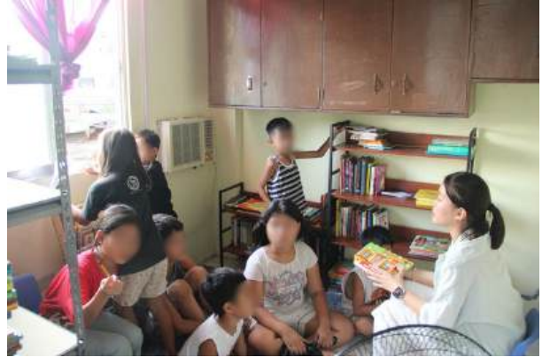
An NSTP-CWTS student leads a storytelling session.

Aklatang KAISA aims to foster a culture of reading and learning by providing accessible educational resources to underserved communities. The libraries are stocked with a diverse collection of books and learning materials, catering to various age groups and interests. These spaces are designed not only as repositories of knowledge but also as safe havens where community members can gather, learn, and grow together.