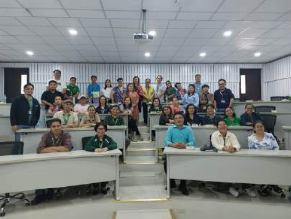
A group photo of OSS personnel with the research presenters and resource speaker