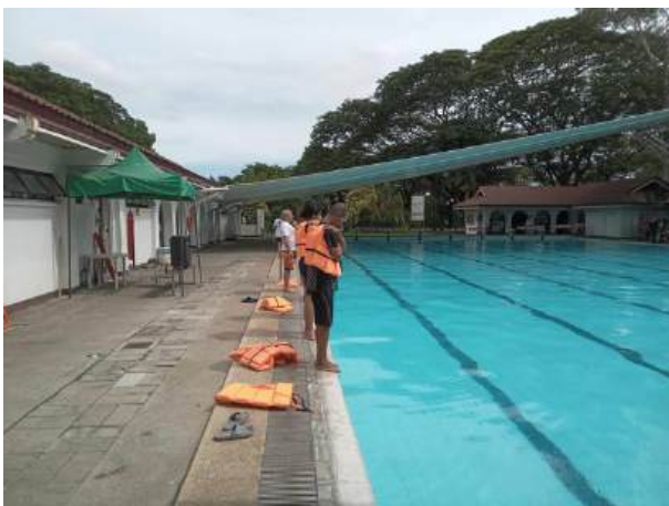
Rescue 177 trainers demonstrate survival swimming techniques.

Participants were also given practical exercises on survival floating and strokes, water rescue and Basic Life Support with CPR for a drowning victim.