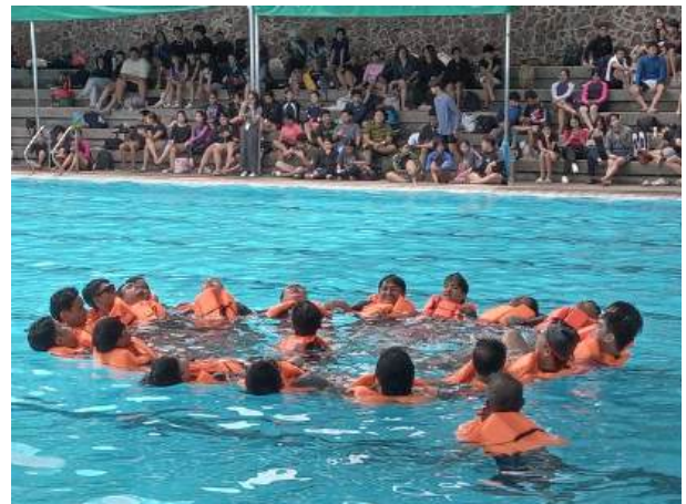
Participants perform a survival stroke technique.

The water rescue and survival skills training is part of the DRRM training program conducted by the NSTP-CWTS Office every school year in partnership with accredited training providers like Rescue 177 Training Center.