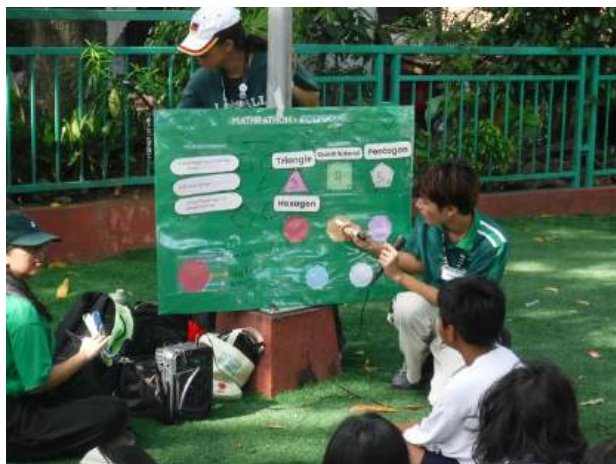
An NSTP-CWTS student engages community children in a lesson on polygons.

The National Service Training Program - Civic Welfare Training Service (NSTP-CWTS) students conducted community service projects throughout April 2025 implementing activities that aimed to address social needs across partner barangays and institutions.