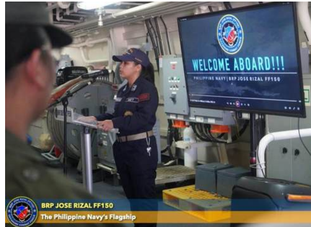
A Philippine Navy Officer orients the tour delegates aboard BRP Jose Rizal, the Philippine Navy's Flagship.

By connecting theoretical instruction with real-world applications, the tour enhanced leadership development and military preparedness. It also fostered camaraderie and teamwork among cadets.