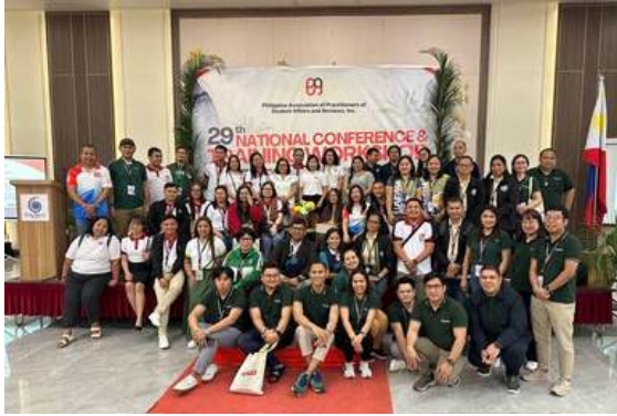
A group photo of student affairs and services practitioners from Region 4.