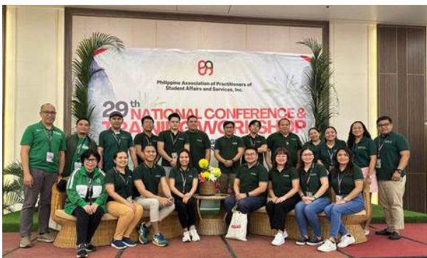
A group photo of student affairs and services practitioners from De La Salle University Manila, De La Salle University Dasmariñas, and the De La Salle Medical and Health Sciences Institute.