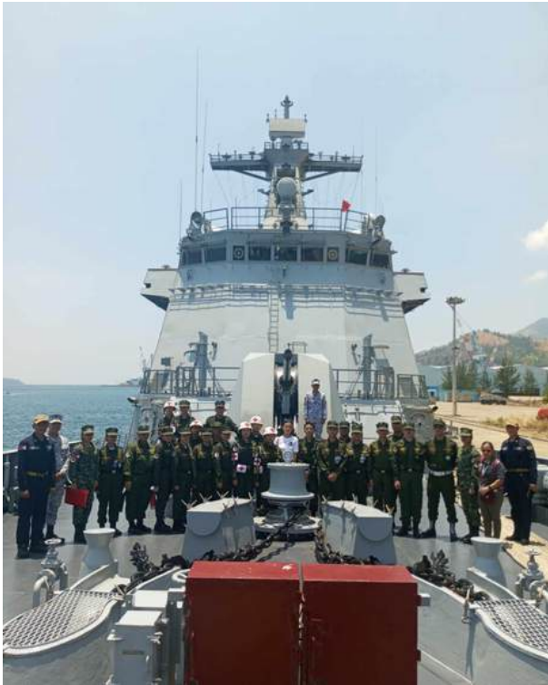
Shipboard tour participants aboard BRP Antonio Luna.

SUBIC, ZAMBALES - On April 12, 2025, cadets from the 267th Naval Reserve Officer Training Corps Unit (NROTCU) of De La Salle University-Dasmariñas (DLSU-D) participated in a one-day shipboard tour at the Naval Operating Base Subic in Barangay Cawag, Subic, Zambales. This educational tour provided MS2 cadets with hands-on exposure to naval heritage, operations, and maritime defense capabilities.