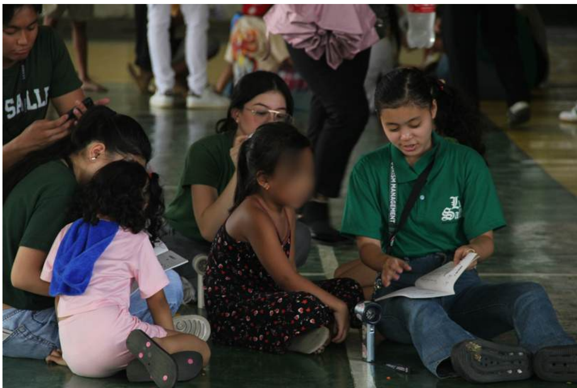
NSTP-CWTS students facilitate a learning session with community children.

In a heartening demonstration of community spirit and dedication to education, Aklatang KAISA inaugurated two new community libraries in Dasmariñas, Cavite this April. The first library opened on April 12 in Barangay San Nicolas II, followed by another on April 16 at the Bahay Tuluyan ng mga Bata, a shelter for girls.