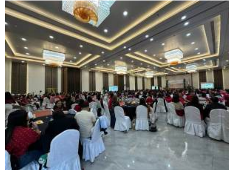
Group photo of the 422 conference participants from 176 schools nationwide.