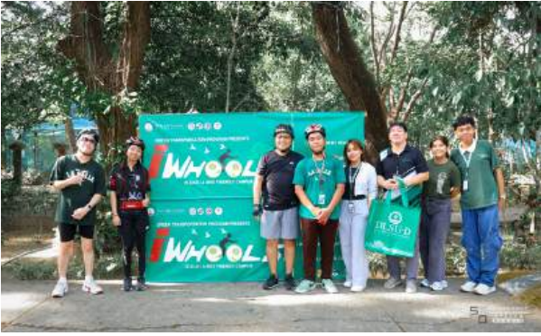
i Wheel organizers and participants pose for a group photo.

The “i WHEEL” event organized in collaboration with the Campus Sustainability Office, GSO Safety and Health Wellness Team, and AAMO carried the theme: