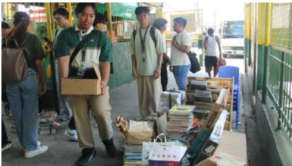
NSTP-CWTS students bring their donated books to Barangay San Nicolas II.

The establishment of these libraries is a testament to the power of collective action and the enduring impact of community service. By bringing together alumni, students, and faculty, the project underscores the importance of giving back and investing in the future of local communities.