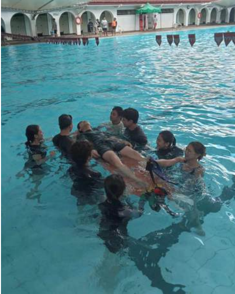
CWTS students demonstrate victim extrication using a spine board.

NSTP-CWTS Chair Jemily Puchero said, "it had been an invaluable opportunity for students as they have experienced practical ways on how to survive and perform water rescues safely and effectively."