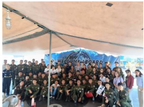
DLSU-D NROTCU delegates, training staff, and faculty companions pose for a group photo.

Cadets boarded three war ships - BRP Jose Rizal FF150, BRP Adress Bonifacio PS-17, and BRP Antonio Luna FF151 - each equipped with advanced facilities and state-of-the-art radar systems. They observed command routines, practiced using navigation equipment, and learned about the daily duties of naval personnel.