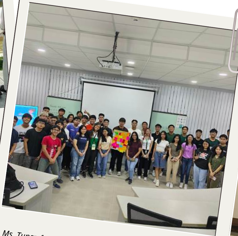
Ms. Tupaz facilitates the freshmen orientation for first-year CEE students at PANIMOLA 2024.