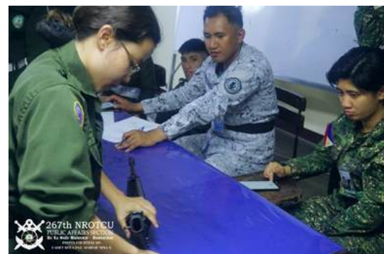
Inspector evaluating the Cadet's proficiency in the assembly and disassembly of the M16.

It also serves as a platform for the unit to present its accomplishments, identify challenges encountered, and receive recommendations for future improvement.