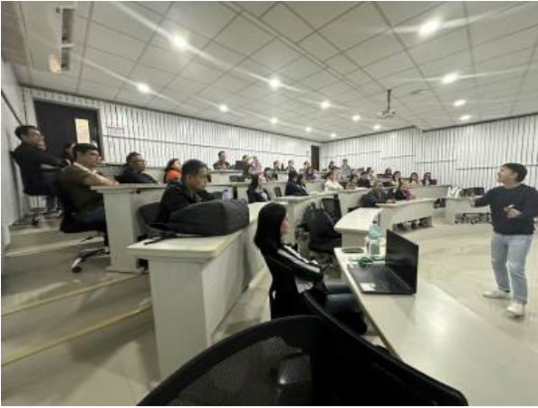
OSS personnel listen attentively during the seminar.

As part of the Administrators, Faculty, and Support Staff Development Series, a seminar titled “Enhancing Support System for Students with Special Needs and Persons with Disabilities,” was held at Gregoria De Jesus Basement 108. The session aimed to strengthen inclusive and accessible student services across the campus.