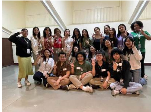
Members of the Vicissitude editorial team listen attentively during the organizational meeting.

As Vicissitude moves forward, the editorial team remains committed to producing high-quality yearbooks and delivering meaningful graduation pictorial services that capture the milestones and memories of the Lasallian community.