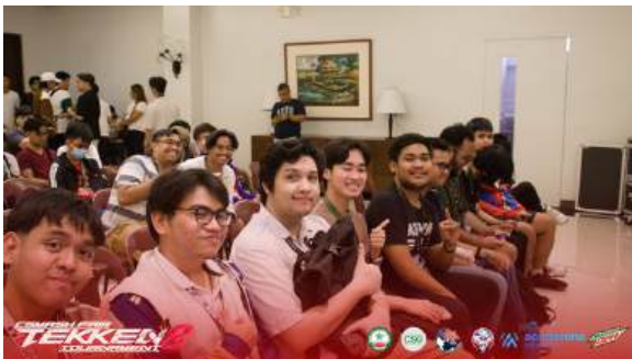
Project:Ikigai's first Tekken tournament

The events provided students with platforms to compete, exhibit their work, and celebrate shared interests within the university setting. More importantly, they created spaces where creativity and “nerd culture” were embraced and validated.