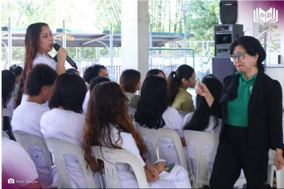
Participants actively engage in the discussion during the session.

The Psychology Society of Cavite State University-Silang Campus held its Second Pinning Ceremony for third-year Psychology students on March 5, 2026.