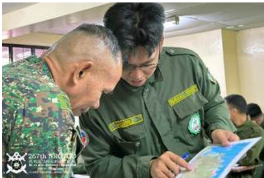
Conducting the Land Navigation eval as the inspector evaluates the Cadet's Proficiency on Map reading.

The 267th Naval Reserve Officer Training Corps Unit (NROTCU) conducted its Local Annual General Tactical Inspection (L.A.G.T.I) on March 14 and March 22, 2026 at De La Salle University Dasmaringas.