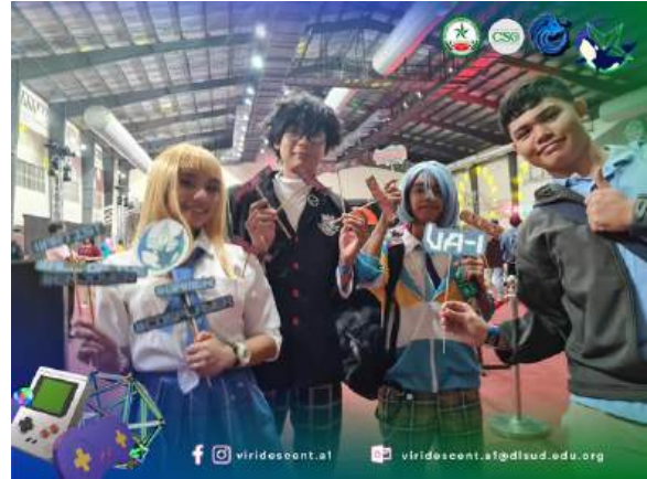
Members of the Project: Ikiqaj during their Recruitment Activity

Like many student organizations, the group has faced challenges in maintaining member engagement amid varying personalities, academic demands, and personal commitments.