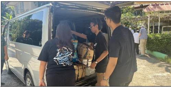
VPAPU members unload donated items from the van upon arrival at the facility.

The Visual & Performing Arts Production Unit (VPAPU), a student organization under the Performing Arts Group of De La Salle University–Dasmariñas, conducted an outreach activity on March 5, 2026, as part of its OBRA 21: The “Perfect” World – What Happens after the 21st Century... initiative.