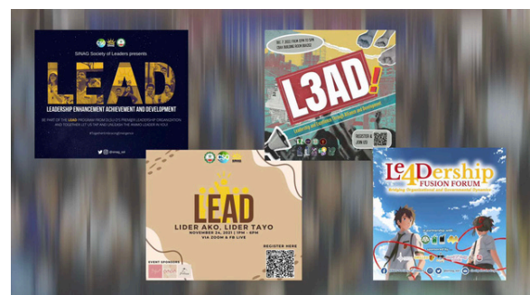
SISOL LEAD 2020-2024