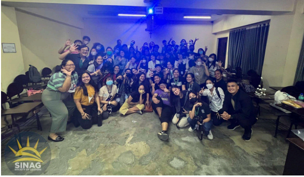
SISOL Batch 2022-2023