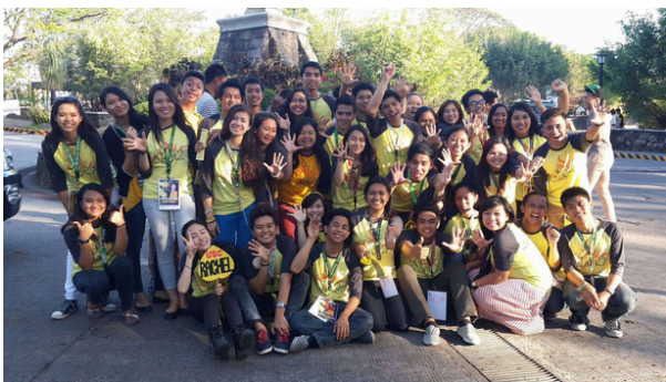
SISOL Batch 2013-2014

What started as a political party in 1999 has since evolved into one of the most admired Recognized Student Organizations (RSOs) supervised by the Student Development and Activities Office (SDAO) and the Council of Student Organizations (CSO). The SINAG Society of Leaders (SISOL) now stands out as a shining symbol of hope, commitment, and integrity in the context of student leadership.