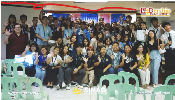
SISOL Batch 2023-2024

What sets the SINAG Society of Leaders apart is its focus on values-based leadership. SISOL hones leaders who not only excel in their roles but live by the core values of loyalty, integrity, commitment, and support. This culture permeates the leadership practices of the organization, extending personal growth and accountability among its members, thus, further contributing to its recognition as a standout organization at DLSU-D.