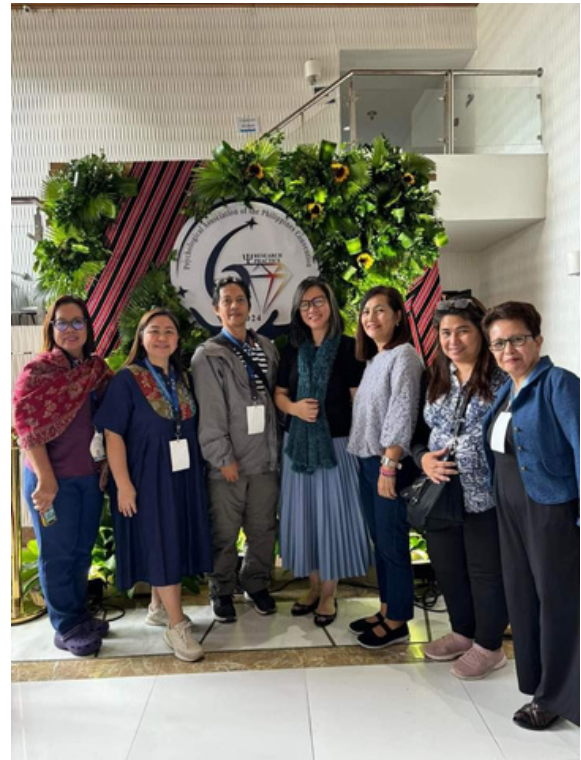
SWC Counselors attend #Your PAPCon2024 from September 26 to 28 at Baguio City.

Participants explored diverse topics, including Assessment Psychology, Clinical Psychology, Counseling Psychology, Developmental Psychology, Industrial & Organizational Psychology, and Social Psychology. Special Interest Groups (SIG) such as, Teaching Psychology SIG, LGBT Psychology SIG, Sports and Exercise Psychology SIG, Psychology Practitioners in Public Service SIG, Positive Psychology SIG, Environmental Psychology SIG, Research in Psychology, and Persons with Disabilities (PWD) Psychology SIG also presented their best practices.