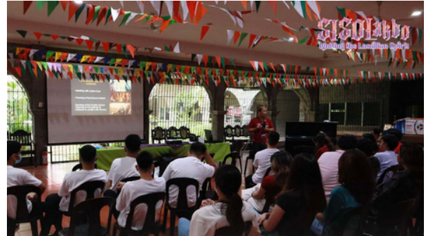
SISOLakbo Outreach 2023-2024

By offering leadership opportunities, promoting collaborative environment, and recognizing individual contributions, SISOL motivates students to support its goals and mission of the university.