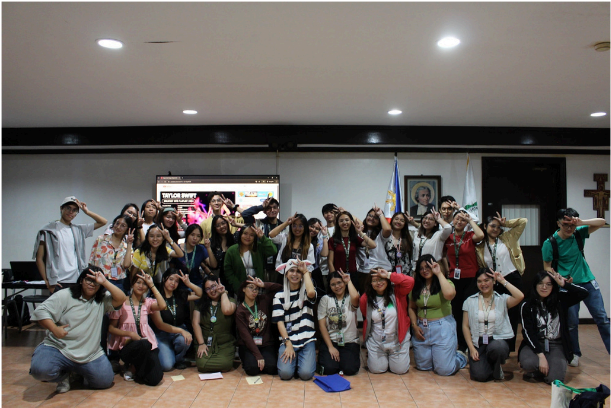
Members of the Lasallian Peer Facilitators (LPF) at Francisco Barzaga Hall.

Lasallian Peer Facilitators (LPF) members gathered for their 1st inaugural General Assembly entitled "PEERchanted": Unveiling the Chapter of Self-Identity on September 25, 2024, at Francisco Barzaga Hall.