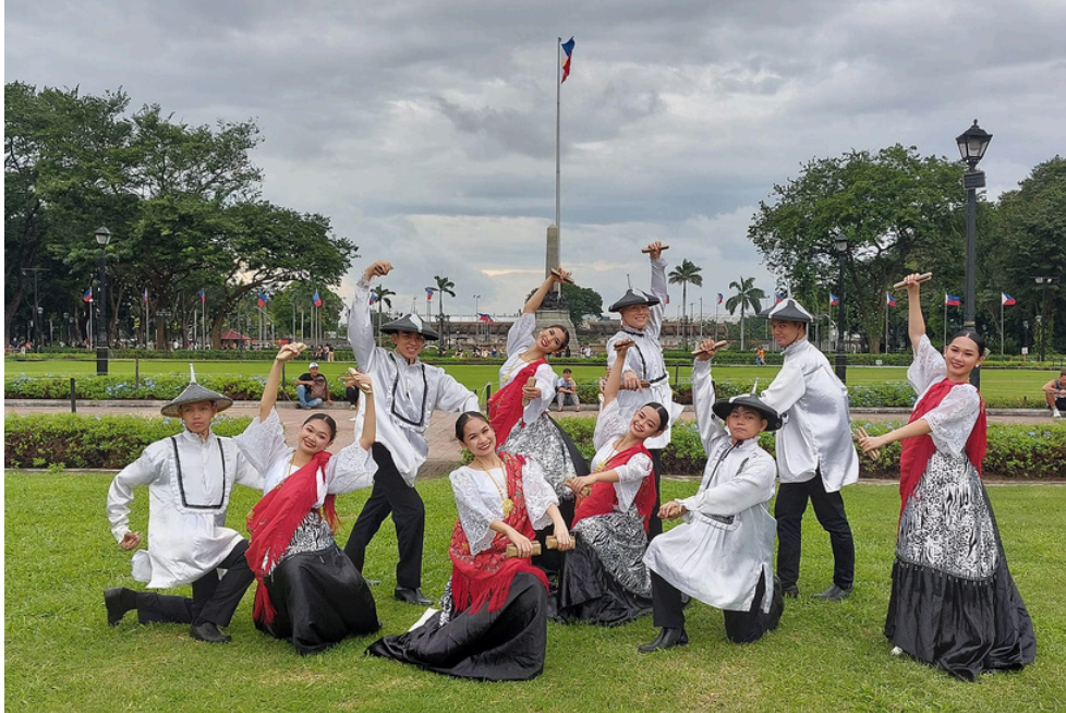
Members of the La Salle Filipiniana Dance Company at the Rizal Monument.

The Filipiniana Dance Company (FDC) took the Rizal Park Luneta stage on September 27 and 29, 2024, to entertain a huge mix of local and international audiences at the Grand Show of the 2nd Manila International Dance Festival dubbed as “DARAKILA,” in celebration of the Philippine Creative & Tourism Month.