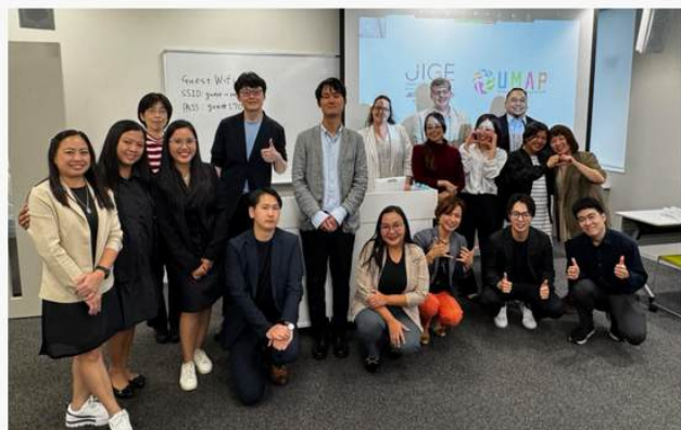
JUNE 9, 2025