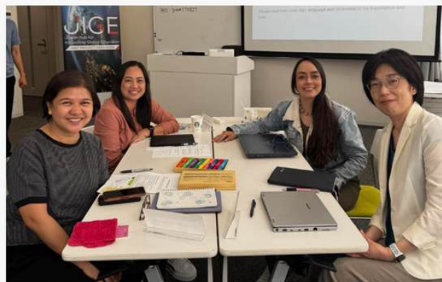
JUNE 9, 2025