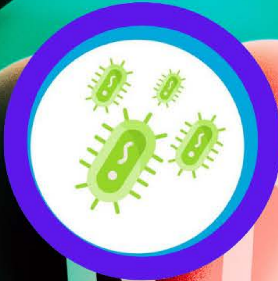
ESCHERICHIA COLI (E. COLI) INFECTION