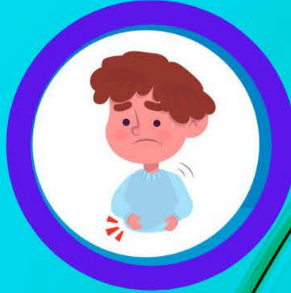
ACUTE DIARRHEAL INFECTION