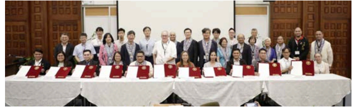
Representatives of Philippine universities sign the agreement.

Academic institutions who pledged their collaboration with the network were led by Handong Global University, Seoul National University, and University of the Philippines Los Baños,