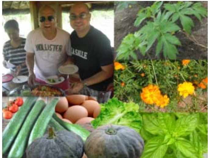
Salad and organic products in Costales Nature Farm

A trainee together with a few other OJT students assisted the CSC group to walk around the farm and experience the relaxing and fascinating farm life. It was interesting