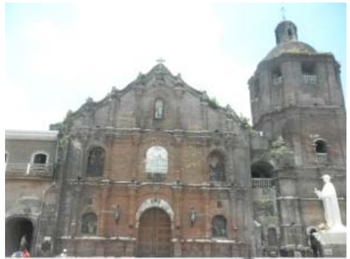
St. John the Baptist Church

The 1939 historic marker stated that the ecclesiastical administration of Lilio belonged to Nagcarlang up to 1605. It was seriously damaged by the earthquake of 1880. Then on April 6, 1898, the reconstructed church and the convent were partly burned.