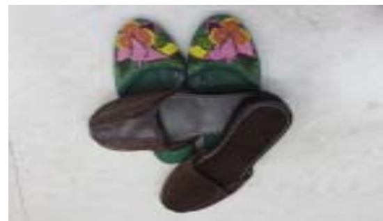
Slippers of Liliw

The municipality of Liliw is also well-known for its footwear industry. A variety of shoes and slippers is sold along the streets adjacent to the church. The visitors from DLSU-D were fascinated to see the different colors and shoe-designs which are remarkably cheaper compared to the mall prices.