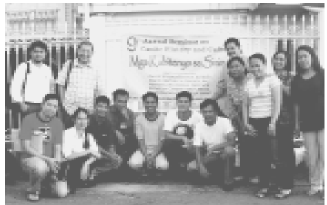
Speakers, guests, organizers and staff at the shrine