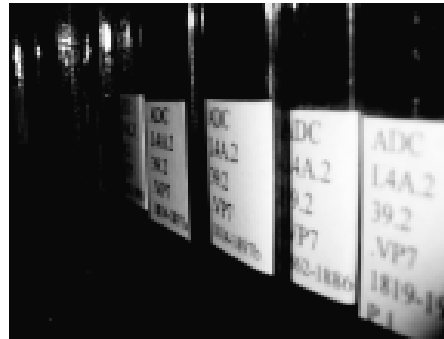
Busy hands at work. Upgrading the system of classification of CSC collections.

The CSC library collections range from archival documents about Cavite province and its towns to books released at the center, Filipiniana and general collections. Books donated by former Prime Minister Cesar Virata are included under the CEAV or Cesar EA Virata collection. Microfiche reels and microfilm rolls from the Ateneo De Manila University and the National Archives and Records Administration can also be found in the center.