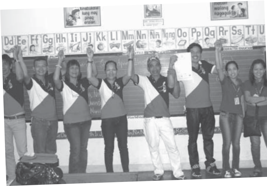
The winners of the 2010 Barangay Elections in Zone I-A