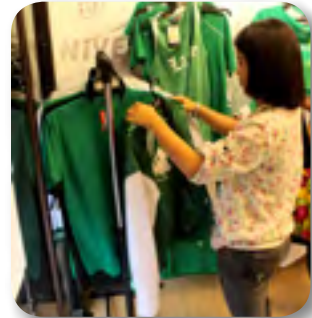
6 Animo Shop opens