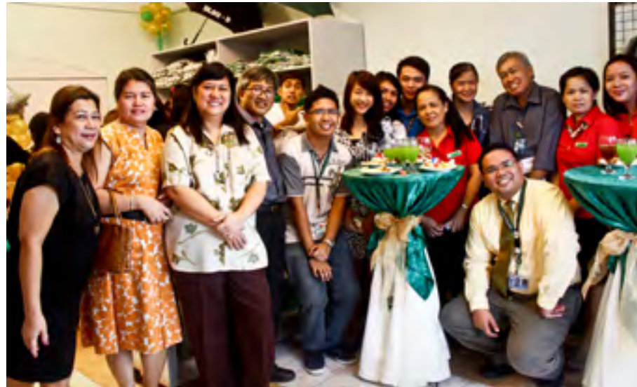
DLSU-D Administrators and Staff strike a pose after the ceremony.