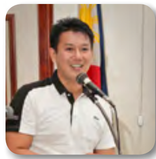
8 City of Imus and DLSU-D bonds for scholarship