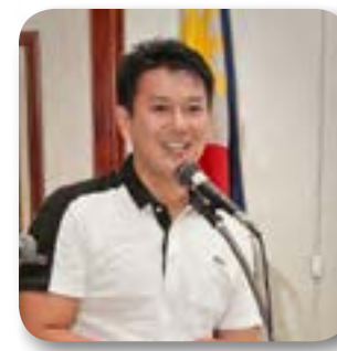
8 City of Imus and DLSU-D bonds for scholarship