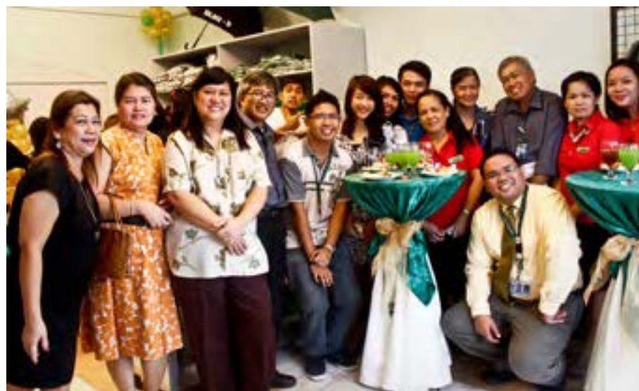
DLSU-D Administrators and Staff strike a pose after the ceremony.