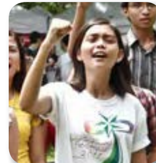
7 DLSU-D celebrates Charter Day