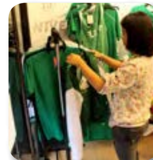
6 Animo Shop opens