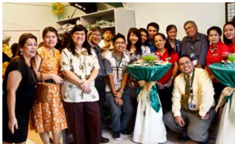
DLSU-D Administrators and Staff strike a pose after the ceremony.