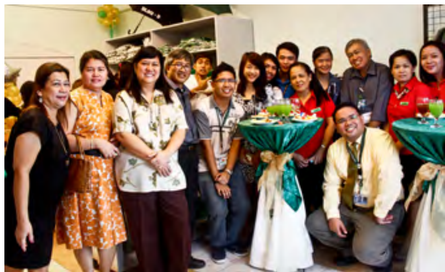
DLSU-D Administrators and Staff strike a pose after the ceremony.