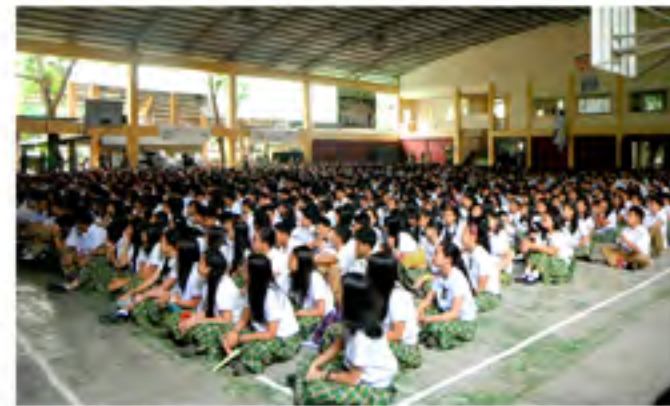
St. Joseph School-La Salle June 25, 2012, 7:56am After a good rest, we attended the flag ceremony at St. Joseph School-La Salle and we had a little talk regarding The Amazing Raise Project. It's amazing that many staff, faculty and Brothers of La Salle schools here are bikers. Some are even triathletes. WOW! ^__^