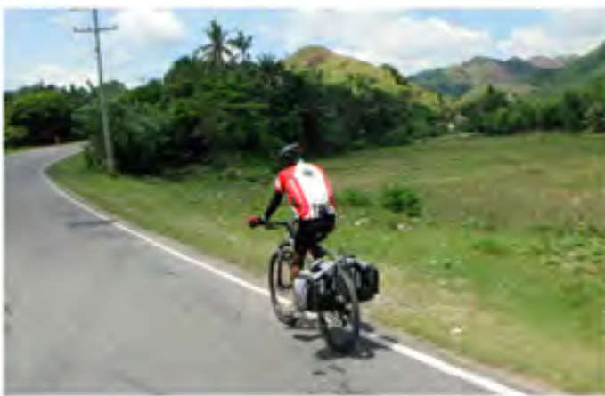
Caticlan to Kalibo, Aklan 11:25am "Climb every mountainnnnn..." Yes, see those mountains? Iloilo has tons of those hilly climbs. Mountains on the right and the sea on the left. Amazing view. Amazing ride! ^ ^