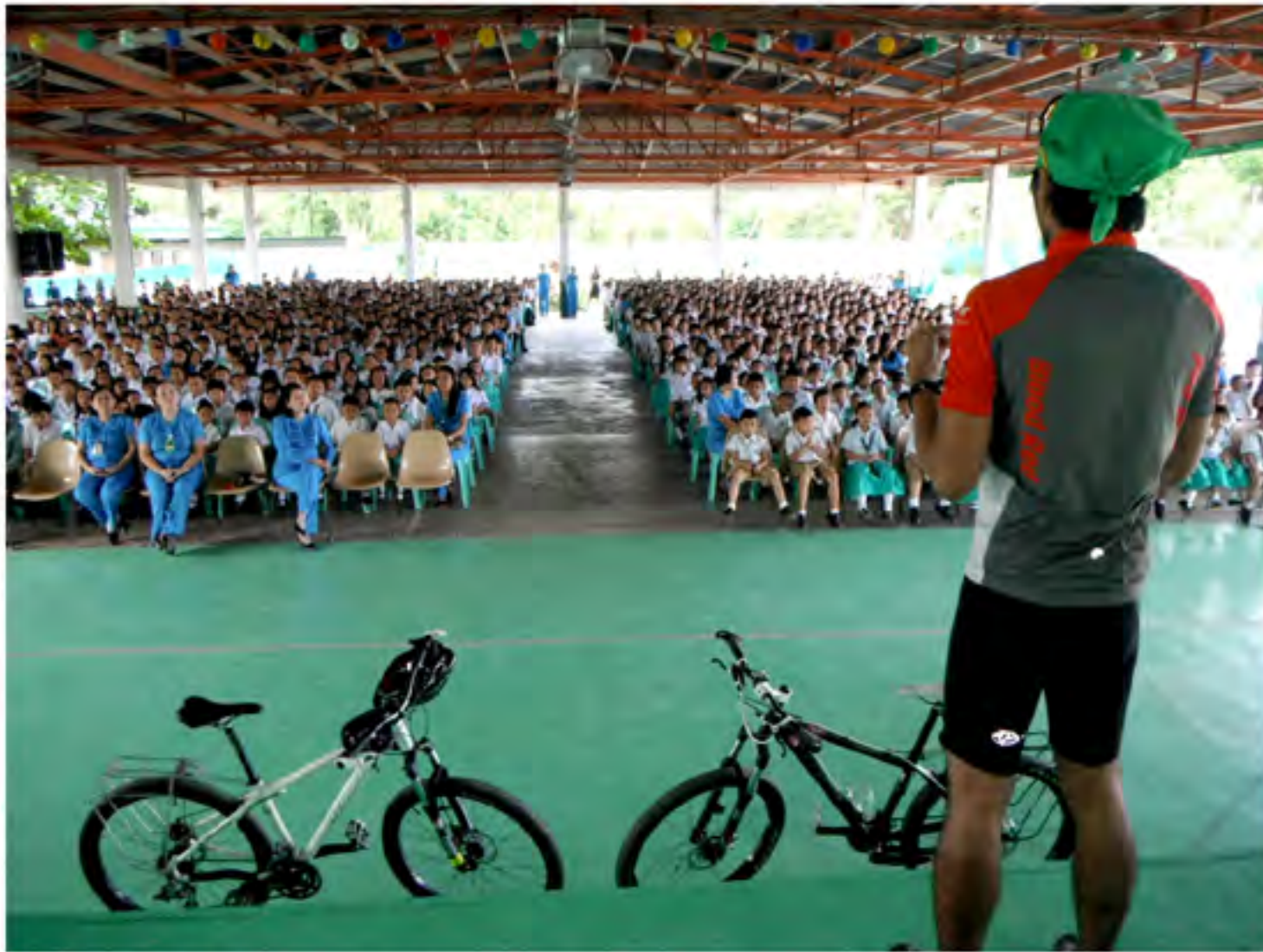
Toledo City, Cebu June 26, 3:43pm Arrived safely in Toledo City Port in Cebu. We met our contacts and headed to DLSASMC.