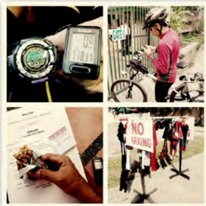
Bacolod City 2:47pm Arrived in University of St. La Salle Bacolod. We stayed in Balay Kalinungan. Gotta washup and rest. ^__^