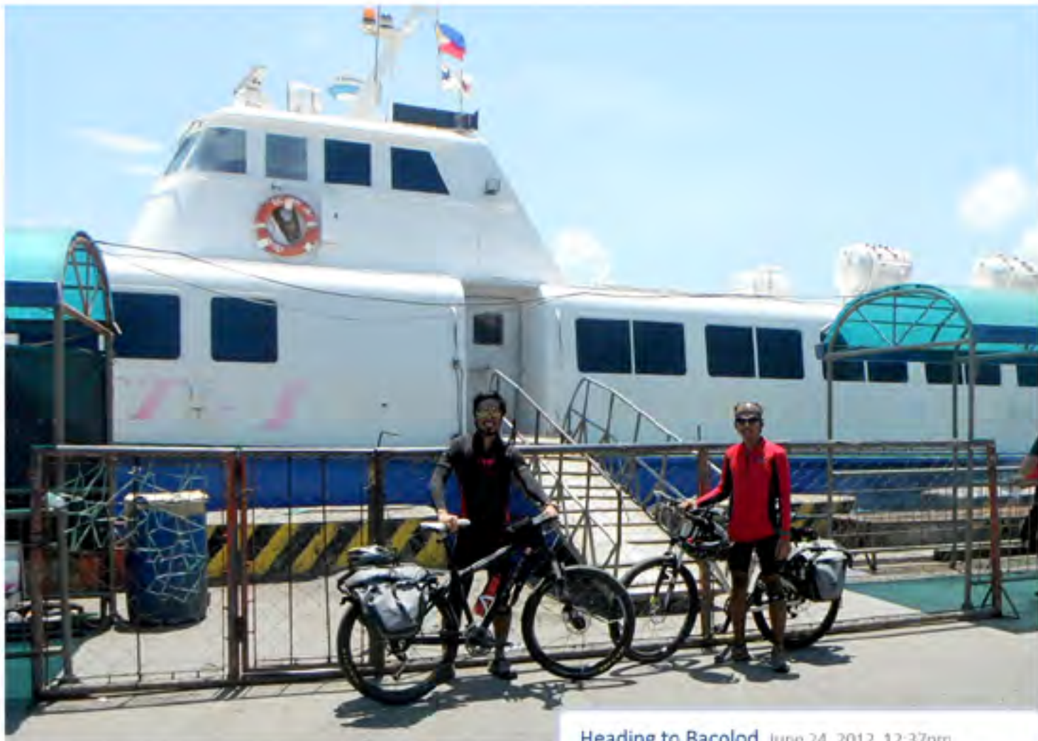
Heading to Bacolod June 24, 2012 12:37pm Goodbye Iloilo T____T. One of the best rides of my life. Next stop is Bacolod City. We're staying in a Lasalle school this evening. YEY! ^__^ Wonder how much we've raised so far, himm?