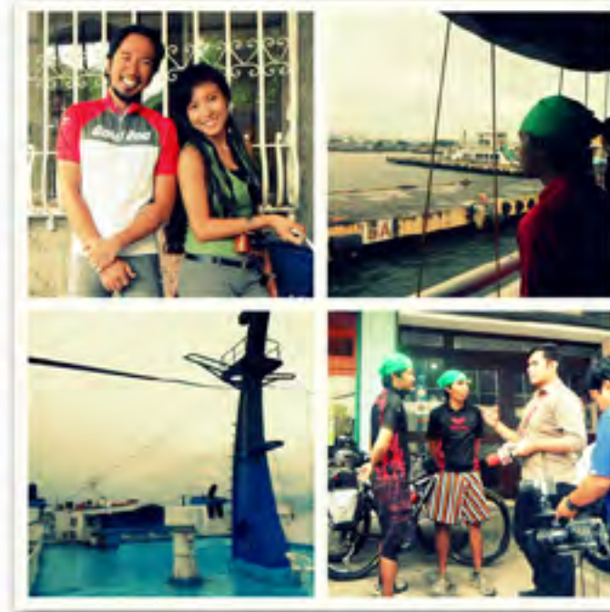
Cebu to Ozamiz June 27-28 Met our major sponsor Blood Red. Interviewed by TV 5 Cebu. Boarded the ship heading to Ozamiz. Almost sleepless in a 10 hour ride.