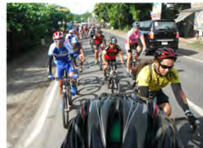
Riding for Cagayan de Oro (CDO) 8:35am With the UCCI group. There were some hill climbs from Iligan to CDO, but when you have people riding with you and cheering you up, things began to look easier. ^ _ ^ Thank you UCCI!