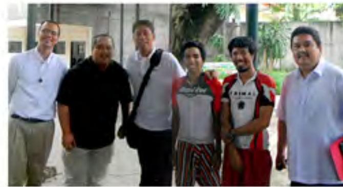
Bacolod City to San Carlos Port This is probably the most challenging mountain bike ride. It's literally a mountain climb from morning till noon. We had riders who joined us in this trip. The scenery and climate while heading to San Carlos port was breathtaking. WHEW! ^__^