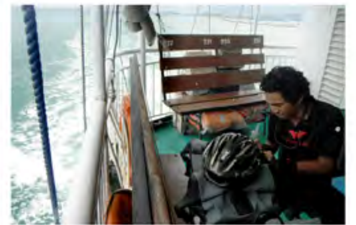
Heading to Cebu 1:36pm It was a many firsts for me. I've been to Mindoro in Puerto Gallera but that's the southern most part of the Philippines that I visited. So it's very exciting to go beyond Puerto Gallera Iloilo, Bacolod, and Cebu. I am also excited to meet our major sponsor Blood Red. I love ferry rides. Makes me real happy to be on the sea. ^__^ Maybe I should try sailing, Hmmm.