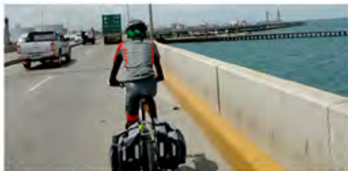
La Salle Toledo to Cebu City June 27, 2012 1:30pm After an overnight stay in La Salle Toledo we went to Cebu City. It was hot but the view entering the city was amazing!