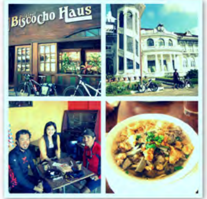
Jaro, Iloilo 12:00nn The taste and textures of Iloilo - Bowl PANALO! ^ ^