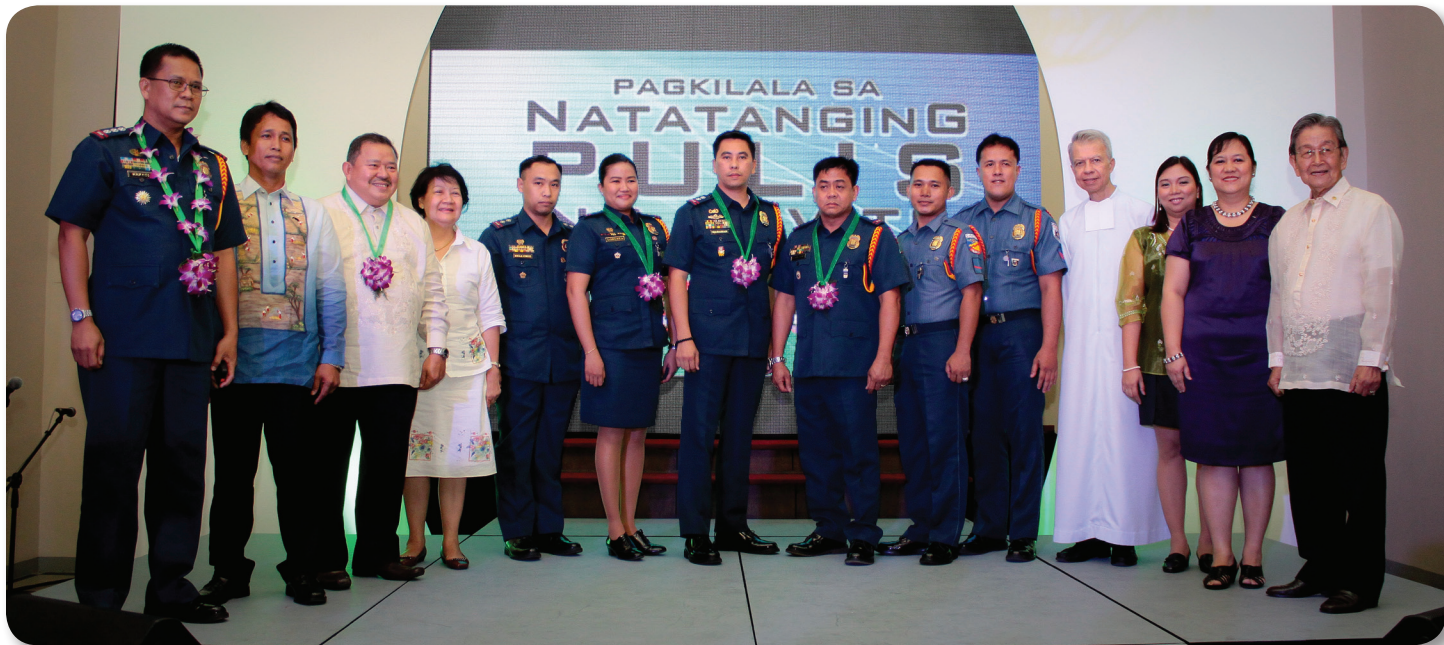
The awardees with the DLSU-D Administrators, and the search's board of judges.

DLSU-D, through its CCJE, aims to recognize the value of police officers as protectors of the civilians and faithful servants of God, the community, and their chosen profession. The award specifically honors the people in the law enforcement who went out of their way to serve the community and the country, sacrificing their time and risking their lives for the sake of the community. Nominations came from the Rotary, Kiwanis, and Lions Club; professional organizations like the Cavite Medical Society, alumni associations, among others; and local government units of Cavite and religious