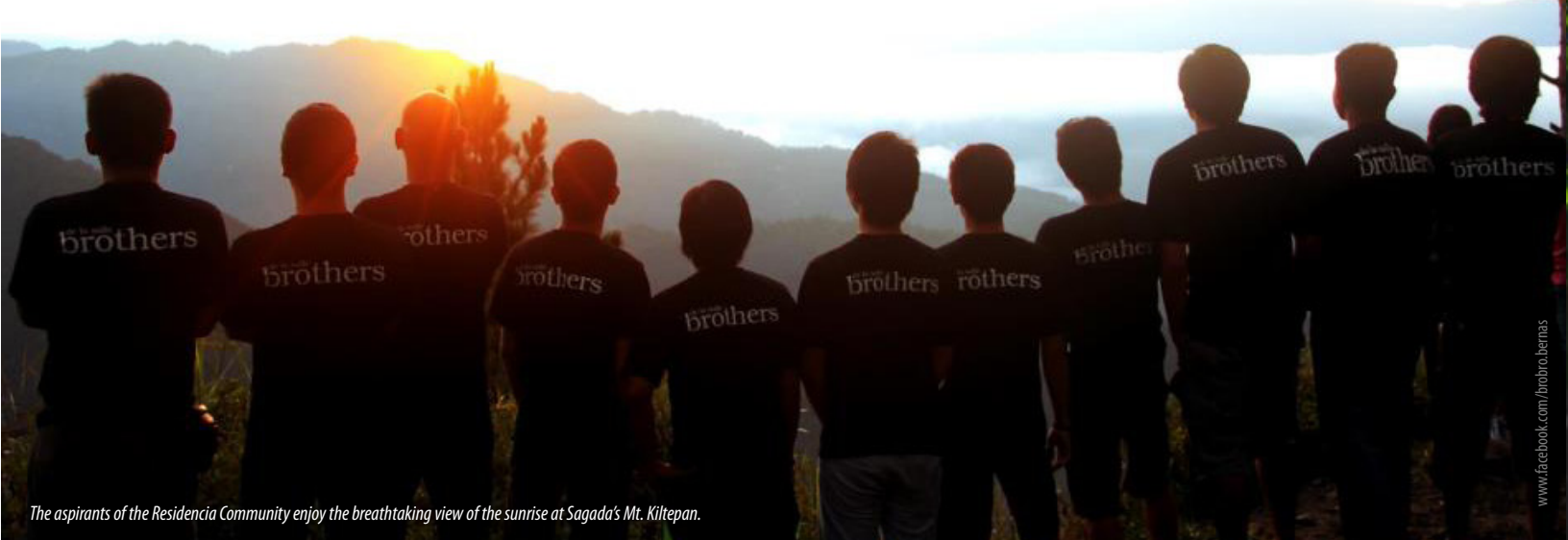
The aspirants of the Residencia Community enjoy the breathtaking view of the sunrise at Sagada's Mt. Killepan.