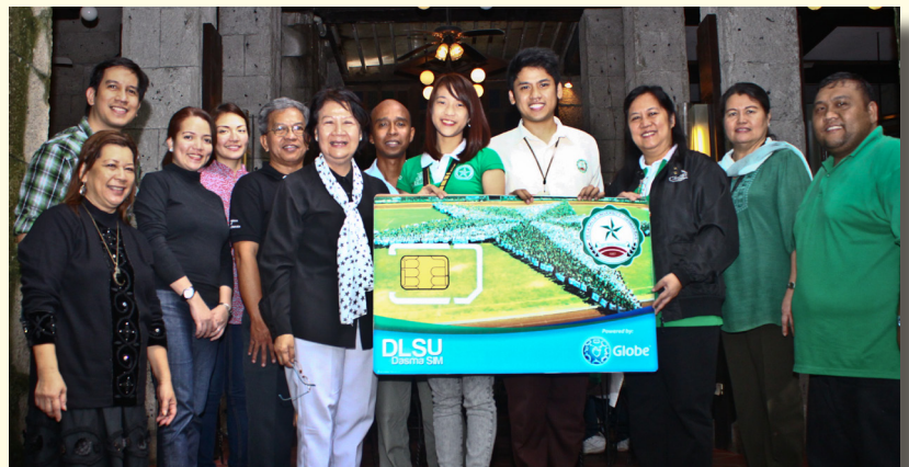
Official SMS announcements will come only from DLSUDASMA.

DLSU-D, through MCO and ICTC, forges ties with Globe Affinity. With this partnership comes new, customized SIM cards that bear the Jubilee logo. The new DLSU-D SIM powered by Globe allows users to receive free announcements via SMS from DLSUDASMA--whether on class suspensions, enrollment schedules, or campus-wide events. Users of the new DLSU-D SIM will enjoy a special rate of P 0.50/SMS and P3.00/minute calls to Globe and TM subscribers.